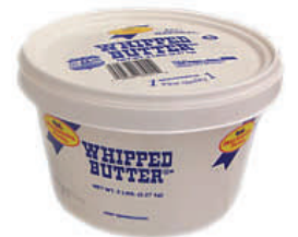
Acceptance of #5-#7 plastic containers increase volume of plastics diverted.

The sheer volume of these plastic containers will make a significant difference in the City's diversion rate if they are properly recycled.