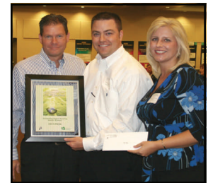
Cici's Pizza with ESOE

For the complete results of the 2009 Environmental Community Awards, visit our Web site.